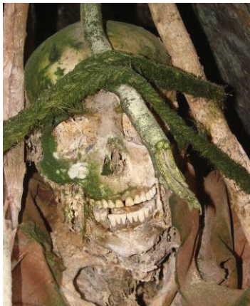
Figure 1. Partially mummified body of an Indian from the Kawésqar ethnic group.

approximately 1 g of bone was decontaminated by successive washes with sodium hypochlorite and distilled water. The bone was decalcified with EDTA and digested with proteinase K prior to organic extraction with phenol:chloroform:isoamyl alcohol and chloroform:isoamyl alcohol. DNA was recovered by isopropanol and ammonium acetate precipitation, washed with 75% ethanol and resuspended in sterile distilled water. DNA was further purified using the Wizard® SV Gel and PCR Clean-Up System (Cat.# A9281) as per the manufacturer's instructions.