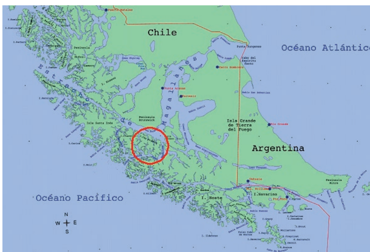
Figure 2. Location of Capitan Diego Aracena Island.

The Y-chromosome haplotype clearly showed the mummy to be an Amerindian. Comparison with available databases allowed grouping of the mummy with populations from Ecuador and Peru. However this is probably due to a bias in the database caused by the scarce information available for Chilean and Argentinean aborigines.