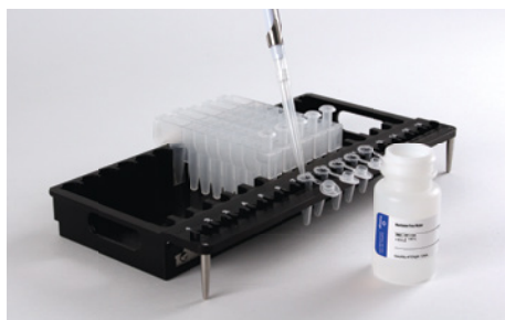
Figure 2. Setup and configuration of the deck tray. Elution Buffer is added to the elution tubes as shown. Plungers are in well #8 of the cartridge.