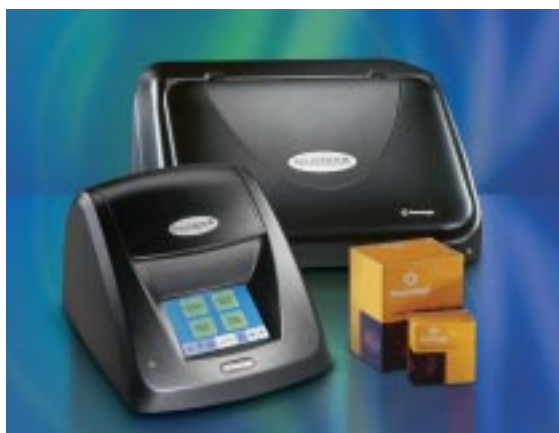
Figure 1. The GloMax™ Luminometry Systems. Bioluminescent assays systems and reagents are available separately (Table 1).

Bioluminescence has long been recognized as an optimal method for measuring biological activities (1–3). The hallmark bioluminescent assay is the luciferase gene reporter assay for quantitative measurement of gene expression. The original firefly luciferase assay system yields linear results over several orders of magnitude, and low background luminescence is found in the host cells or assay chemistry. Promega has developed a suite of bioluminescent assays that maintain this high quality but measure other biochemical or cellular activities of interest to the biological researcher (Table 1). Furthermore, these assays are easy-to-use and adaptable to different throughput needs.